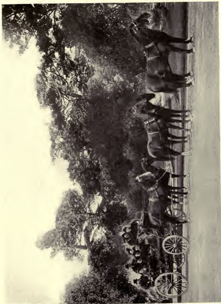
CLIMBING MT. HAMILTON, CALIFORNIA, 1896